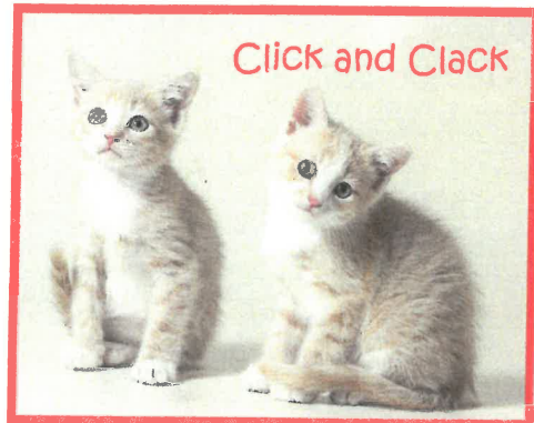
Click and Clack

The Patterson Foundation will provide a 2:1 match for contributions from new donors for donations up to $100. New donors are individuals who did not give to Cat Depot in the 2015 Giving Challenge.