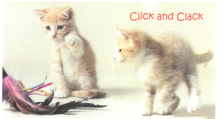
Click and Clack

The 2016 Giving Challenge is presented by the Community Foundation of Sarasota County with giving strengthened by The Patterson Foundation, as well as support from Manatee Community Foundation, John S. and James L. Knight Foundation, William G. and Marie Selby Foundation, and the Herald-Tribune Media Group.